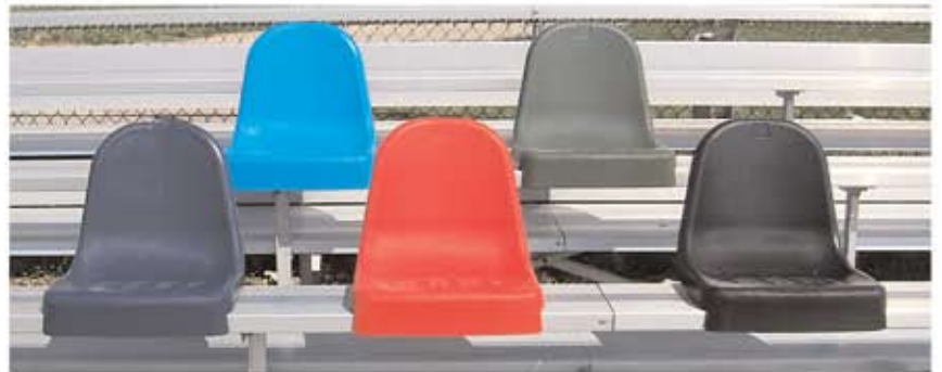
Unlimited Colors Available